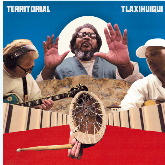
Territorial - Tlaxihuiqui