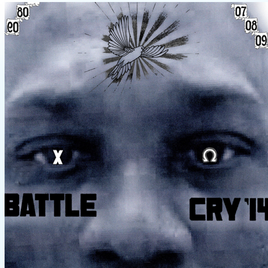
Territorial - Battlecry '14