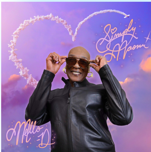
Simply Naomi - Mello-D